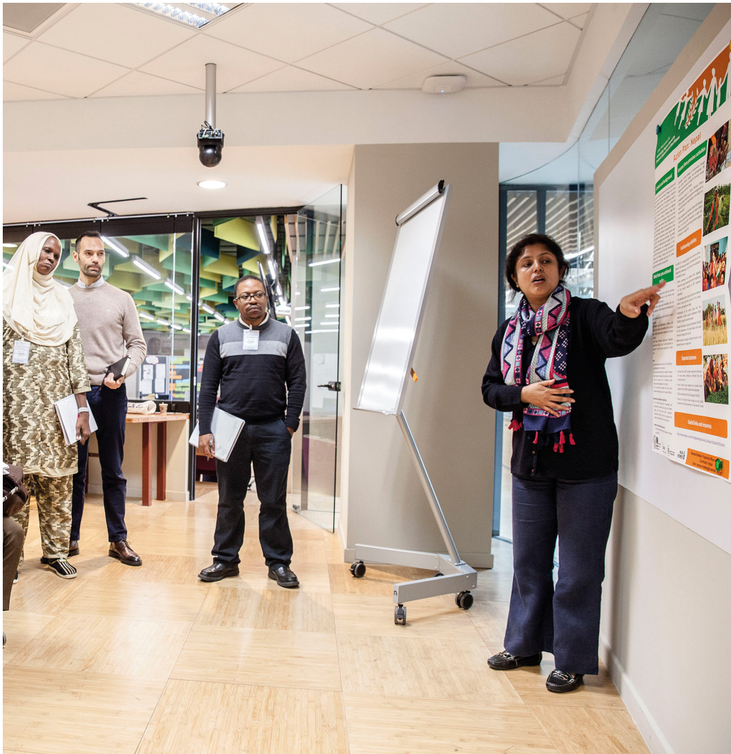
23 February 2017, Rome Italy - Workshop: Accelerating progress towards the economic empowerment of rural women with 7 country coordinators from the UN Joint Programme (FAO, IFAD, WFP and UN Women), FAO headquarters (Iraq Room).