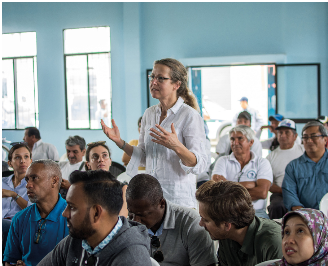
26 October 2018, Guayaquil, Ecuador – Multi-partners “Coastal Fisheries Initiative (CFI)” to promote sustainable fisheries management practices aimed at building vibrant coastal communities in Ecuador.

This section examines concrete ways to help stakeholders agree on a shared vision and, from that, develop realistic action plans with a clear strategic view behind them.