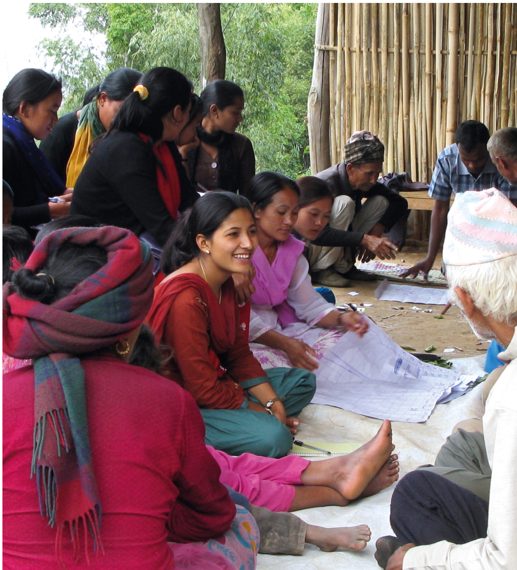
Discussion with rural women. Agriculture in Nepal.

>> Annex 1, Building Block 5 provides a list of tools and resources for financing MSC initiatives.