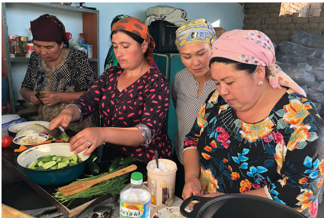
As part of community-based nutrition education sessions, beneficiaries of FAO Productive Social Contract / Cash+ pilot project learn how to improve traditional dishes to enhance their dietary diversity and address nutritional needs.

Building Block 3 provides more insights into capacity-building for MSC engagement (see also related tools and resources in >> Annex 1, Building Block 3 ).