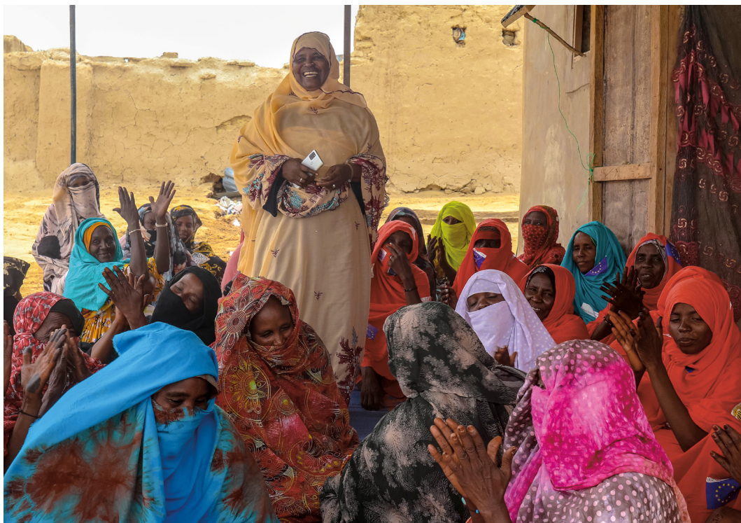
Community-based conflict resolution communities in Kanem gathering to fight against malnutrition.

However, the participation of all non-governmental organizations cannot be considered the same, with efforts needed to include the direct representatives of marginalized groups. 53 Also there is the risk that "civil society" participation could be skewed in favour of non-governmental organizations that are better resourced and with better capacities. In addition, some non-governmental organizations may lack a clear mandate for the groups they are representing. 54 Consumers are also an important actor in the agrifood system, but their voice can also be absent from the dialogue table. Involving consumers' organizations in MSC initiatives can help to raise awareness among citizens of the opportunities and challenges facing the food system and the role they can play in shaping a sustainable food system.