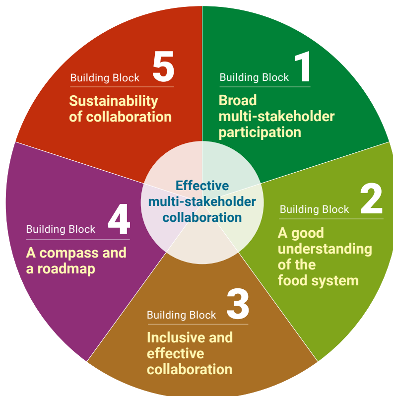
Figure 1. Graphical representation of the guide’s Building Blocks