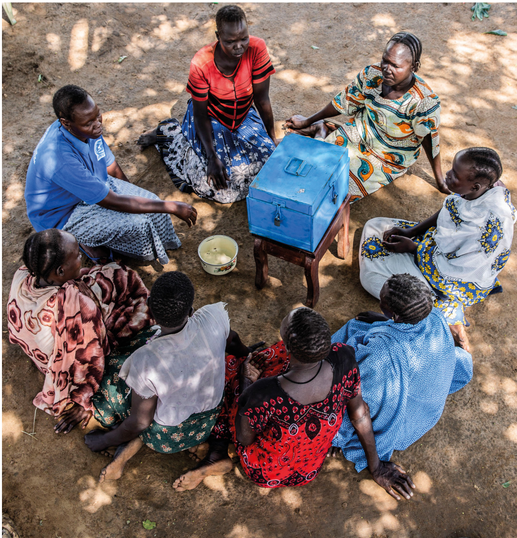
29 May 2018, Torit, South Sudan - FAO Agropastoral field schools (APFS) project provided a flexible and responsive platform for building the knowledge and skills of farmers and livestock keepers of all ages in South Sudan.

Once action plans, as described above, have been put into motion, a monitoring and evaluation (M&E) system will be required to continuously monitor the initiative’s success and to evaluate learnings for any adjustments needed to the strategy. The M&E process will also require the allocation and embedding of resources (i.e., time, funds and human resources) within the action plan. 116 When technical competencies on M&E are not available, capacity-building from development partners may be provided, or expertise hired. 120 It is also important that M&E is internalized in the initiative, so that it is not perceived as a standalone reporting task. 105