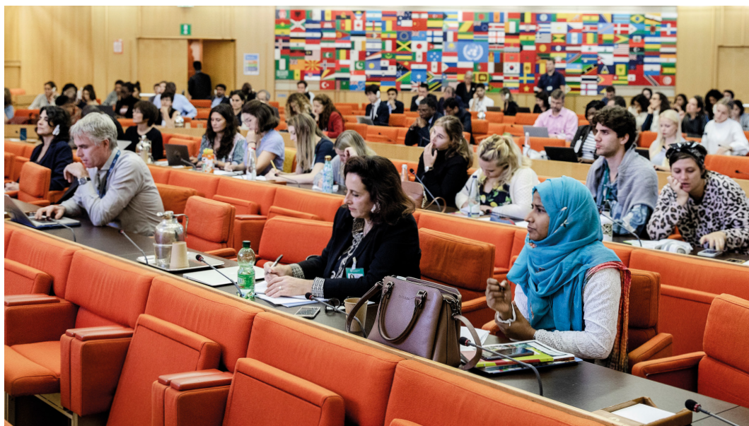
17 October 2019, Rome, Italy - CFS 46 Side-Event on data and information systems can empower family farmers, advance goals of the United Nations Decade of Family Farming (UNDF) and guide better policy.

>> Annex 1, Building Block 4 provides a list of tools and resources to develop a strategy.