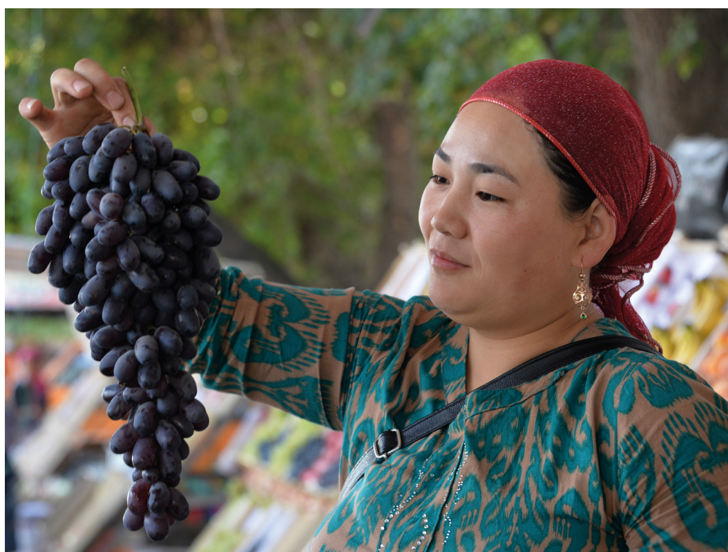
A Woman sells vegetables and fruits on the road near Kant 20 km from Bishkek, Kyrgyzstan on 22 August 2016.