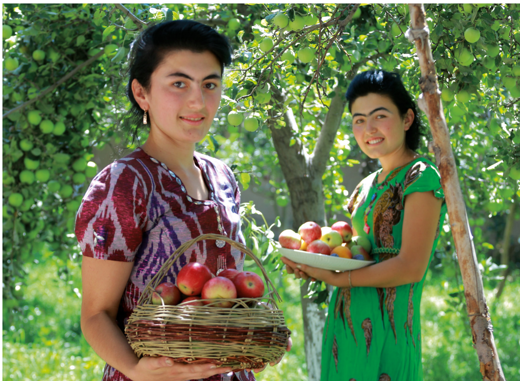
Yangikurgan rayon, Namangan province, Uzbekistan. Farmers care for their apple gardens thanks to modern drip irrigation technologies they got with support of FAO project “Promotion of water saving technologies in the Uzbek water scarce area of the transboundary Podshaota river basin”.

This does not mean that MSC will be easy, simple or even be successful, but it does offer a way to address complex challenges involving the stakeholders needed to have a chance of success.