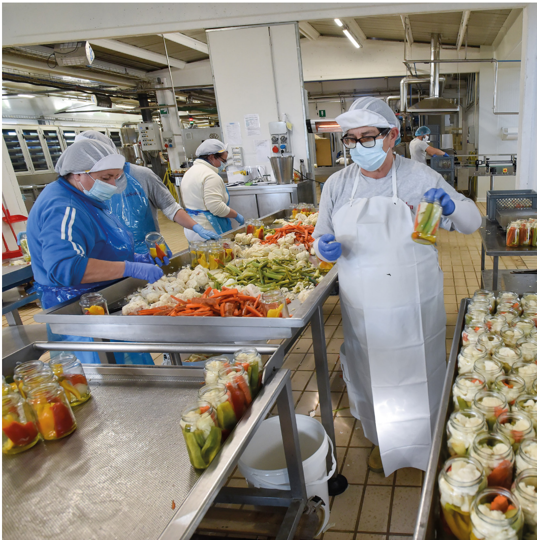
24 November 2021, Albinia (Tuscany), Italy - Workers of La Selva organic farm preparing canned vegetables.

Communication is a core pillar of any MSC initiative, requiring a variety of processes to engage people and develop understanding, consensus, ownership, meaningful alliances and strong partnerships. 92 Communication takes place on a range of levels – for instance, through individuals, where the quality of personal interactions will depend on the extent to which individuals listen and engage in dialogue; as well as collectively, where stakeholders develop and communicate a common message to contribute to change. 25 Several challenges that can adversely affect communication include: divergent views and preconceived ideas, not listening to others, lack of trust, and an uncondusive environment for sharing experiences and discussion. 78,92